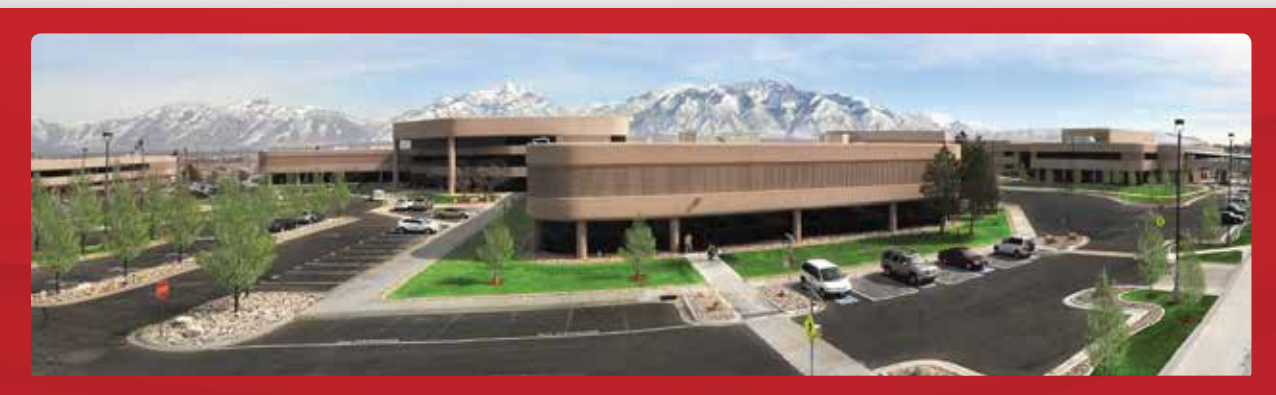
Corporate Headquarters, South Jordan, Utah

Before using, refer to Instructions for Use for indications, contraindications, warnings, precautions and directions for use.